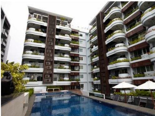
The Next building