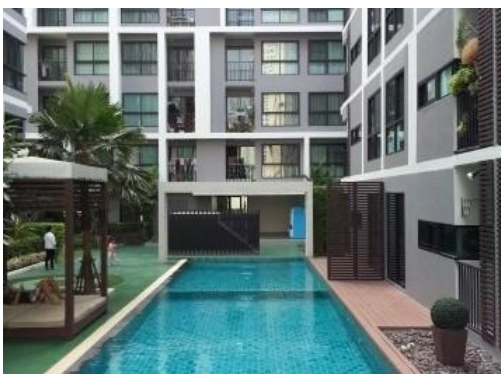
Metro Sky building

Package deliveries are done by couriers which use a special “delivery” key. After each package is delivered to the locker, the courier enters the package’s identification number. Metra Server sends a XML package containing the identification number to the 3 rd Party SW & DB Server which in return sends customer’s key (PIN code) and device assigns it as a locker key.