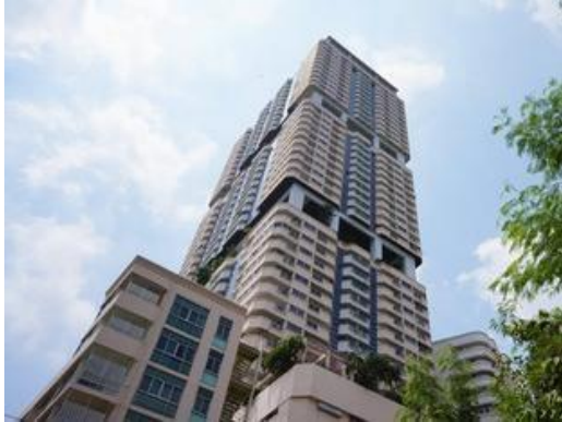
Diamond Sukhumvit building