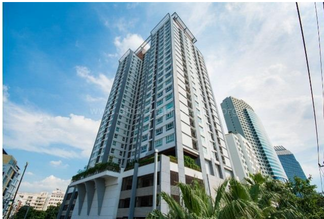
Diamond Ratchada building

Each locker location offers quality electronic locks connected to the central user interface. To ensure highest possible system availability, a Metra Server is use at each separate location, offering packages pickup even when internet connection to the server cannot be established.