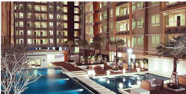
Ivy Ratchada building

Customers that are not often at home, do not have time to collect the package anywhere else or just want privacy, are able to use delivery lockers service when purchasing items on-line.