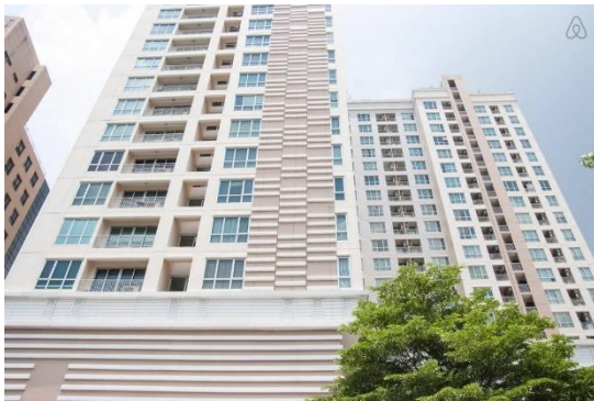
Life Ratchada building

3 rd Party SW & DB Server also sends customers messages informing them their packages have been delivered. Messages include package number, location information, locker number and a PIN code. Customer unlocks the locker by entering locker number followed by a PIN code at Display Combo user interface unit. System allows customer to collect their package.